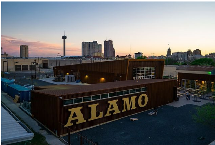
Alamo Brewing Company.