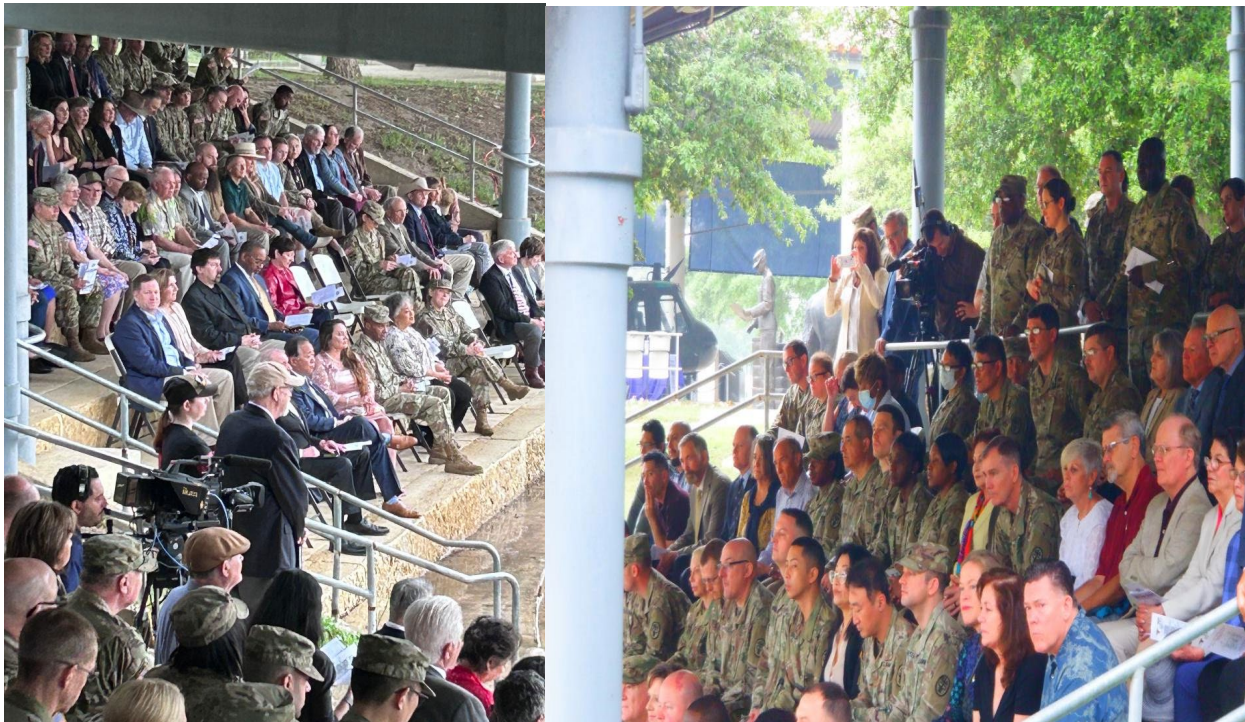
Attendees for the dedication of the Army Dentistry Monument at the AMEDD Museum amphitheater.