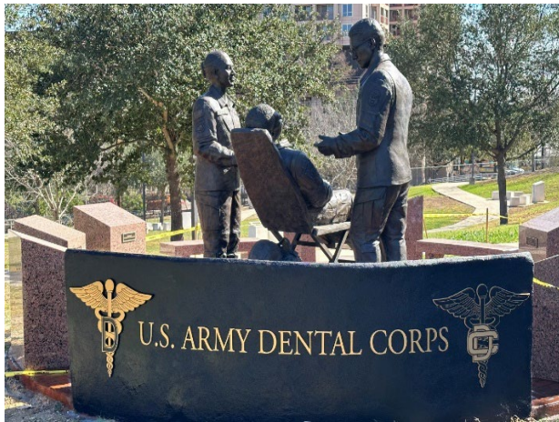
The back wall of the monument.