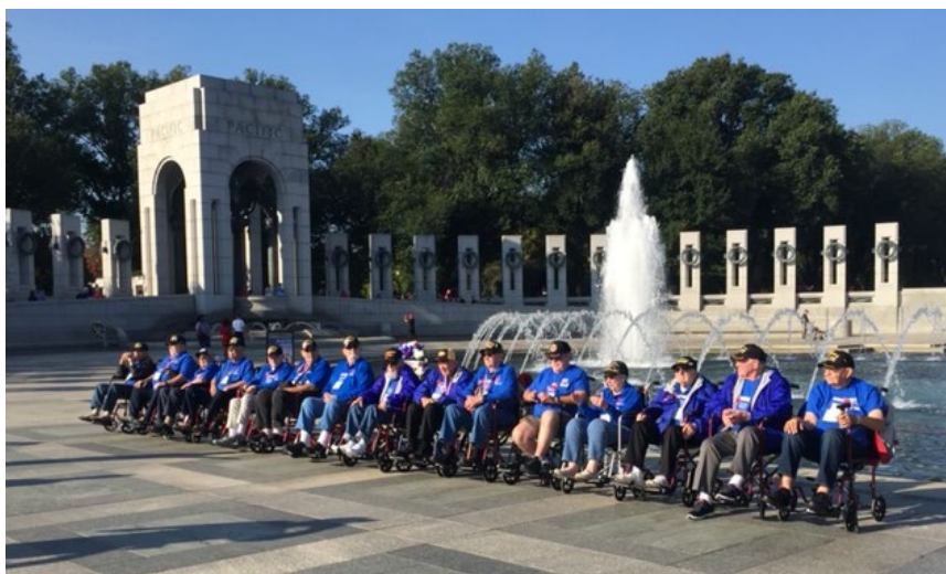
VETS TO WASHINGTON PROJECT – WWII MONUMENT, DC