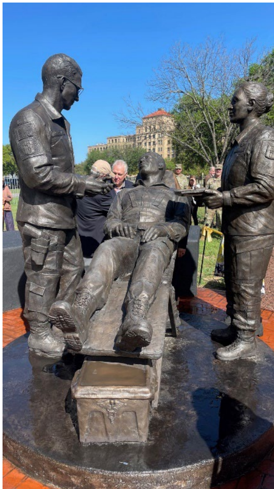
The central statues after the dedication.