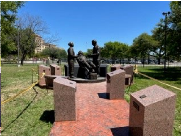
The central statues and supporting monoliths.