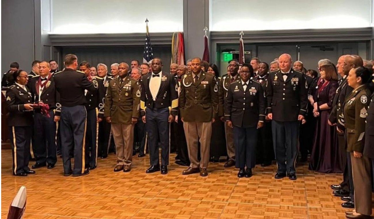
O2M3 Induction Ceremony