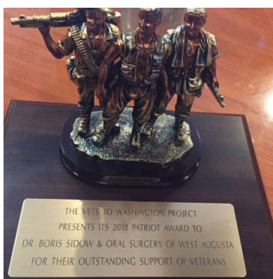
Vets to Washington Project 2018 Patriot Award