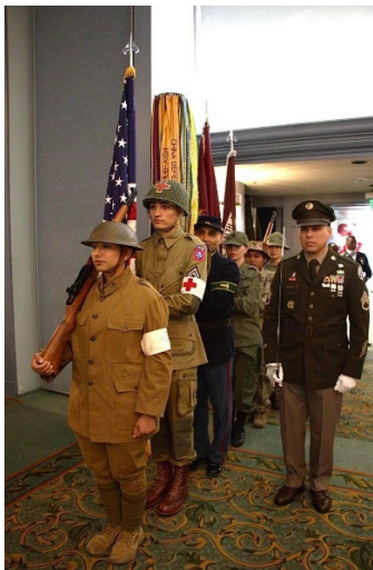
The Color Guard.