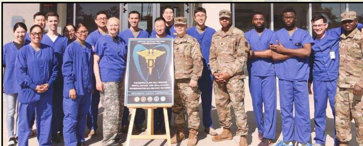
From Left to Right:

Special thanks to all the highly motivated volunteers!