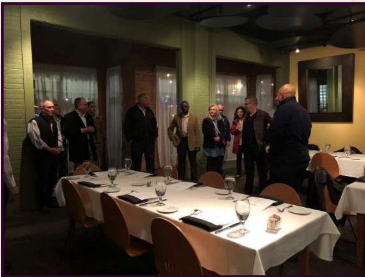
BG Bagby addresses participants of the DLSPS during the event social held of 19 February, thanking them for coming and critical efforts to define the future of the Corps.