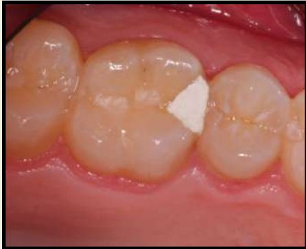
Figure 4: Patient states "The dentist has replaced this filling 3 times, and it still hurts when I'm eating. They have tried the metal and white fillings."