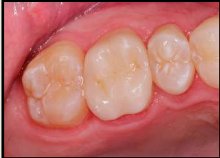
Figure 6: Final minimally invasive milled restoration with patient asymptomatic on follow-up.

Residency is challenging, but the training you receive will give you both a professional and financial advantage over those who do not do advanced education. Only 1% of general dentists have achieved board certification status from the American Board of General Dentistry. Being board certified will open up the door for better academic appointments when combined with the Master's degree in Oral Biology you will receive, and will give you a competitive advantage when searching for employment when your journey in the Army comes to an end. You will have the opportunity to be immersed in digital dentistry and how that digital dentistry applies to the general practitioner without having to pay for expensive training or having to buy the equipment in your own dental office. Although there are many of the same topics covered in the prosthodontic residency the comprehensive dentist needs to focus on the big picture, and what will affect the majority of the population. A residency in comprehensive dentistry will provide you pay that is on par or exceeds other dental specialties in the Army while making your future employment have a much broader geographic and professional scope and opens you up to a larger patient population