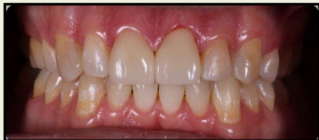
Figure 3: in less than 12 weeks we maintained the natural dentition, and the patient never went without a tooth.

The reason I chose to be a comprehensive dentist will most likely be different than the reason you may choose to pursue a residency in comprehensive dentistry. I have had the ability to travel the world to support special operations, lecture at professional dental meetings, teach young dental officers, work as part of a world class dental specialty team, and interact with multinational medical officers. Your career may not look like mine, which is the great part of choosing comprehensive dentistry. The Army recognizes the role of a well-rounded, well trained general dentist (63B) within the strategic critical war time needs of the operational force. 63Bs will be at the forefront of making difficult decisions at the Office of the Surgeon General, directing the professional growth of dental Officers at HRC, and implementing effective ways to train dental officers at Graduate Dental Education. Operationally 63Bs have the ability to command dental companies, command dental health activities, and advise hospital commanders as a chief of dental clinical services. Tactically you may choose to take on a role with special operations as a group dental surgeon, to take your comprehensive knowledge to the point of injury and the tip or Army diplomacy through medical civil action missions. Clinically you will be called upon daily to make tough decisions involving complex clinical situations.