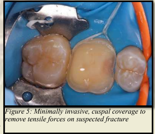
Figure 5: Minimally invasive, cuspal coverage to remove tensile forces on suspected fracture

Residency is challenging, but the training you receive will give you both a professional and financial advantage over those who do not do advanced education. Only 1% of general dentists have achieved board certification status from the American Board of General Dentistry. Being board certified will open up the door for better academic appointments when combined with the Master's degree in Oral Biology you will receive, and will give you a competitive advantage when searching for employment when your journey in the Army comes to an end. You will have the opportunity to be immersed in digital dentistry and how that digital dentistry applies to the general practitioner without having to pay for expensive training or having to buy the equipment in your own dental office. Although there are many of the same topics covered in the prosthodontic residency the comprehensive dentist needs to focus on the big picture, and what will affect the majority of the population. A residency in comprehensive dentistry will provide you pay that is on par or exceeds other dental specialties in the Army while making your future employment have a much broader geographic and professional scope and opens you up to a larger patient population