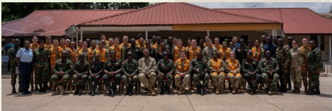
Ghana Armed Forces (GAF) personnel at the 37th Military Hospital, U.S. medical professionals from Landstuhl Regional Medical Center (LMRC), Dental Health Activity Rheinland-Pfalz/Bavaria, Public Health Command Europe and the North Dakota National Guard at the medical readiness exercise (MEDREX) on May 23, 2025 in Accra, Ghana as part of African Lion 2025 (AL25).