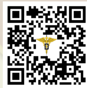
Scan for the Army Dental Corps Chief Facebook Group